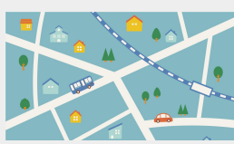
Maps and History