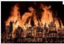
The Great Fire of London