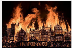
The Great Fire of London