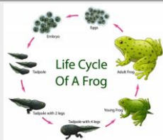
Life cycles and reproduction