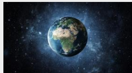
Earth and Space